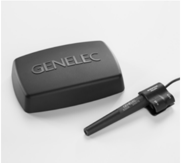
Network adapter and measurement microphone

Genelec AutoCal™ measures the response in the listening area and applies relevant compensation in the low and low-mid frequencies to minimise the detrimental room acoustic anomalies as well as the differences between various listening positions.